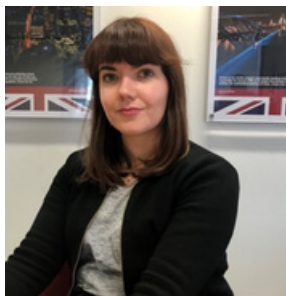
Catriona Boyd Deputy Consul General, United Kingdom Consulate General Melbourne

Catriona Boyd is the Deputy Consul-General at the British Consulate-General in Melbourne and is focused on ensuring maximum benefit is realised from the UK-Australia relationship across Victoria, South Australia and Tasmania.