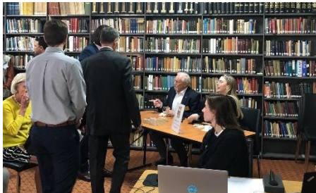
Gareth Evans book-signing

And we were delighted to host The Hon Gareth Evans AC KC FASSA FAIIA to launch his latest book Good International Citizenship: A Case for Decency .